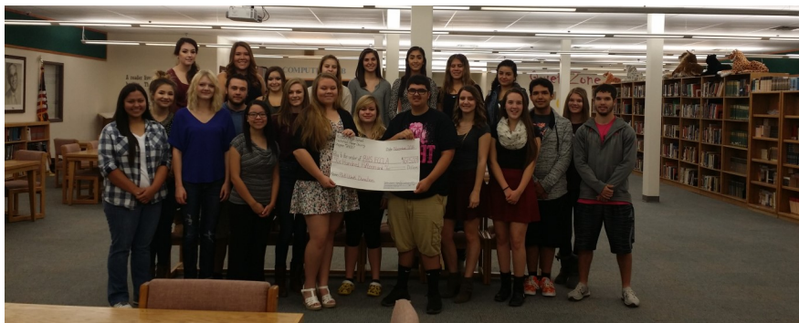
Raton Honor Society presents a $615.00 check to the Raton FCCLA

November 12th, at 1:00 pm, here in Raton. The team is currently in the 7th seed with an overall record of 6-4 and 2-2 in district play. If the team loses this game, they will be out of the playoffs. If they win, however, they go up against the Capitan Tigers (9-1 overall, 4-0 in district play).