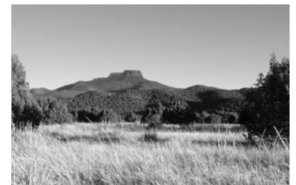
Fisher's Peak

Towering above the communities of both Raton and Trinidad and standing at 9,600 ft is Fisher's Peak. The ranch known by some as "Crazy French Ranch", has been a regionally recognized for years. Standing tall through generations and housing many of the areas well known wildlife.